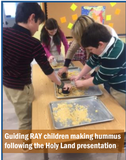
Guiding RAY children making hummus following the Holy Land presentation