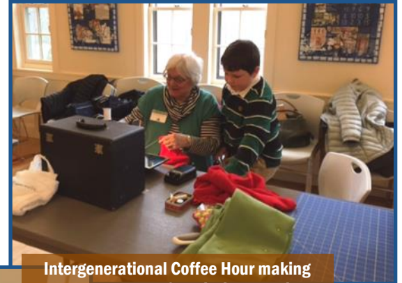
Intergenerational Coffee Hour making scarves together for Mission Morning