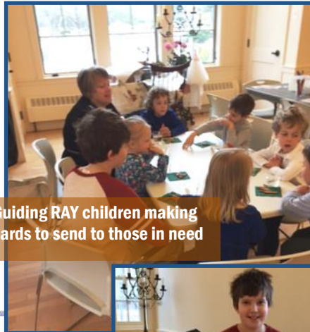
Guiding RAY children making cards to send to those in need