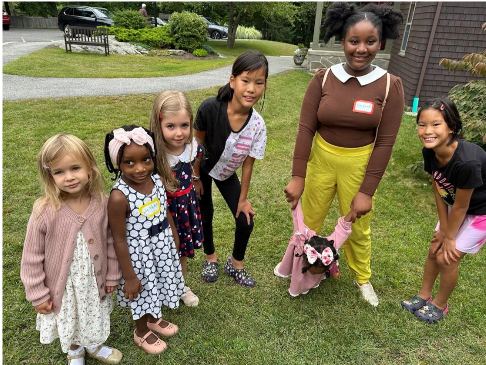
Some Guiding RAY Sunday School students in September 2023