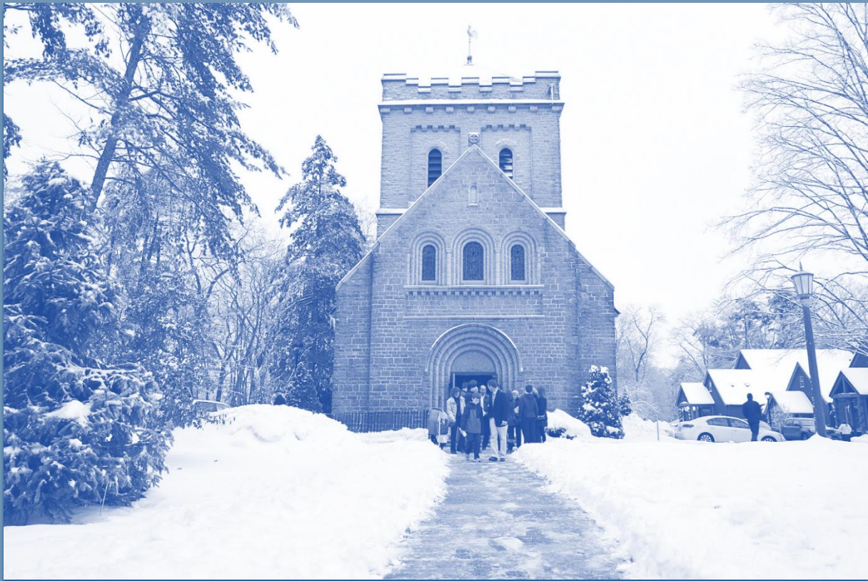
on Christmas Eve 2017